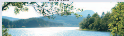
Ben Lomond from Loch Ard