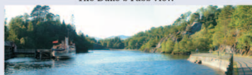
Loch Katrine and its steamer pier