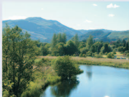
Ben Ledi - the mountain of the Gods

Explore The Trossachs Guides with maps is a six page guide to this fabulous part of Scotland. Here Sir Walter Scott wrote his books Rob Roy and the Lady of the Lake. The first Thomas Cook's tours came here nearly 200 yrs ago to see the marvellous scenery. Ask for your free guide from your accommodation provider.